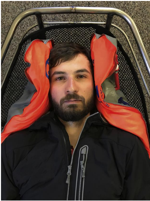
Caption: Demonstration of patient with spinal cord protection implemented via spinal motion restriction of the neck and back using a vacuum splint rather than rigid cervical collar and long board.

Other updated guidelines cover the prevention and treatment of acute altitude illness; prevention and treatment of frostbite; prevention and treatment of heat illness; prevention and treatment of drowning; water disinfection for wilderness, international travel, and austere conditions; and out-of-hospital evaluation and treatment of accidental hypothermia. They also highlight several important questions that remain to be addressed and could serve as a focus for future research, such as, the role of acetazolamide in preventing and treating high altitude cerebral edema; determining the optimal rate of ascent to prevent altitude illness; the role of staged ascent, preacclimatization, and hypoxic tents in altitude illness prevention; optimal methods of resuscitating hypothermic patients in cardiac arrest; and the use of technological innovations to allow access to wilderness pursuits such as big wall rock climbing and scuba diving that have historically been off limits to those with diabetes.