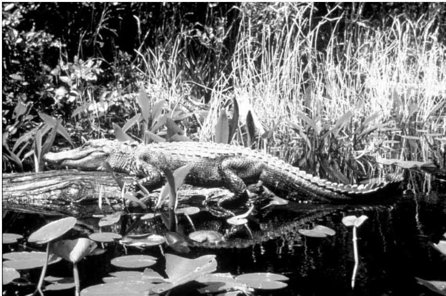
Figure 2. Alligator mississippiensis

Reports of alligator bites from previous surveys 9,10 were also evaluated for additional cases of bites or attacks that current state officials may not be aware of, for different personnel may currently be responsible for alligator complaints.